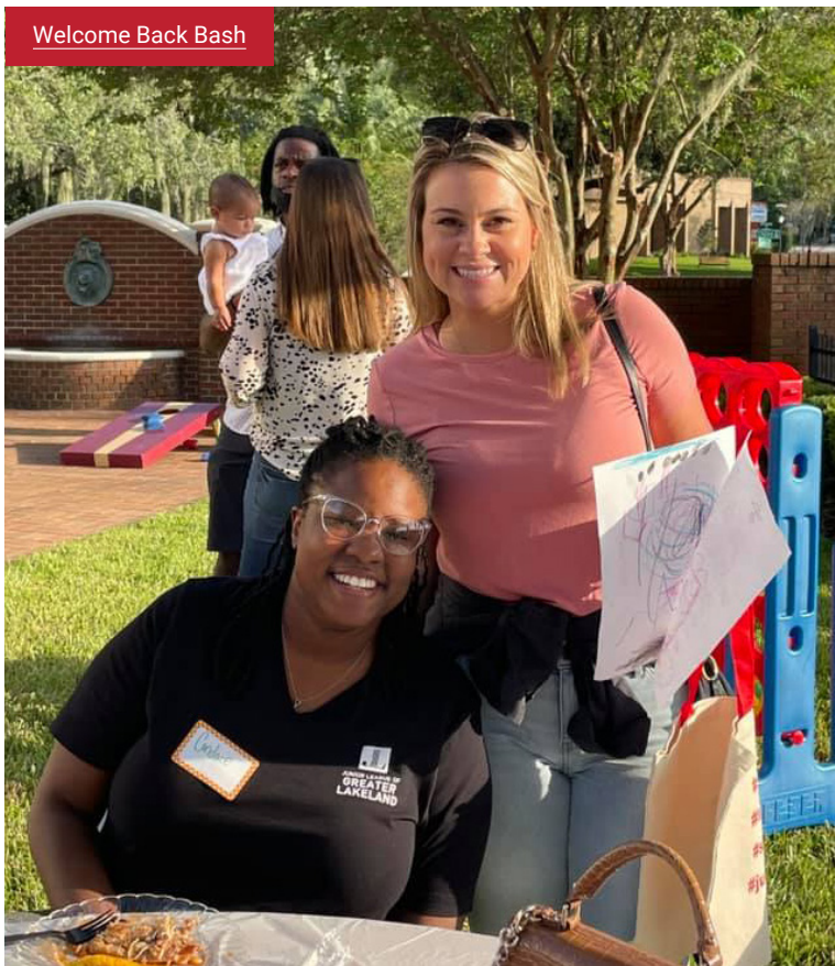
Sustainer Spring Gathering