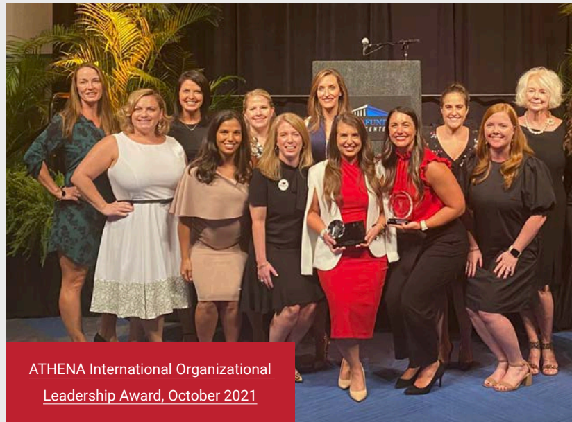
ATHENA International Organizational Leadership Award, October 2021

In March, the League hosted a Community Stakeholder Roundtable attended by over 25 invited community leaders. Robust discussions ensued, and feedback was provided to the League to assist with strategic planning initiatives and to better understand the needs of our community.