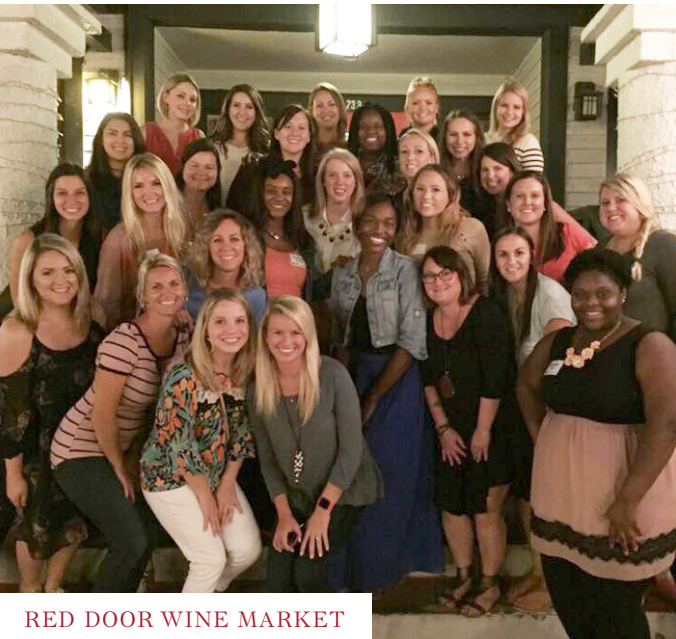
RED DOOR WINE MARKET