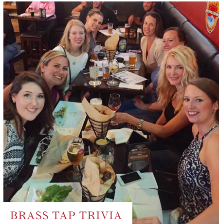
BRASS TAP TRIVIA