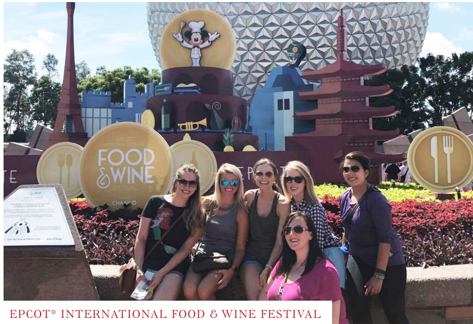
EPCOT® INTERNATIONAL FOOD & WINE FESTIVAL