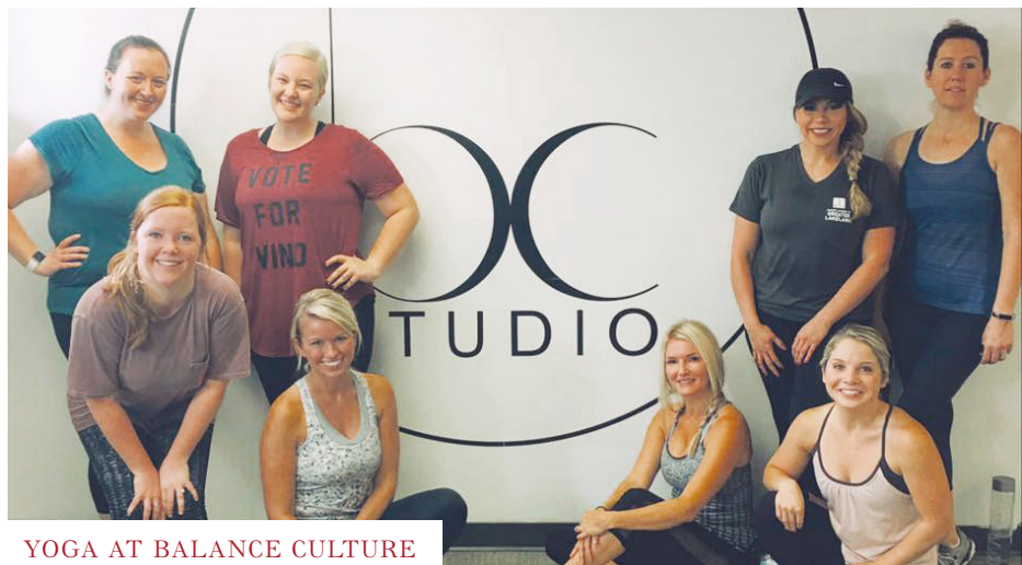
YOGA AT BALANCE CULTURE