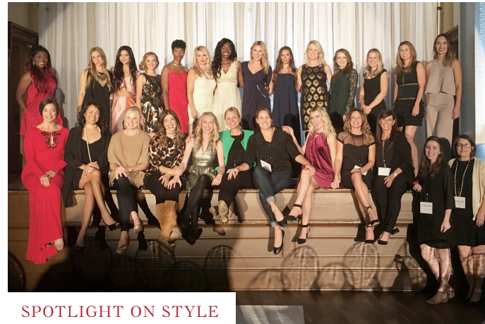
SPOTLIGHT ON STYLE